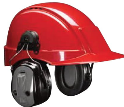
P3* - Helmet Attachment