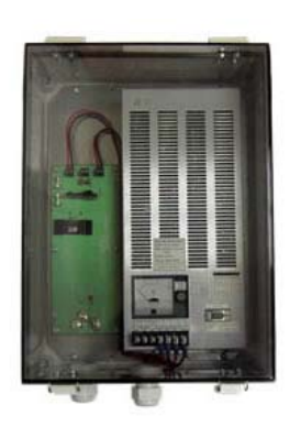
RNG-DC16 (left), RNG-DC36 (right)