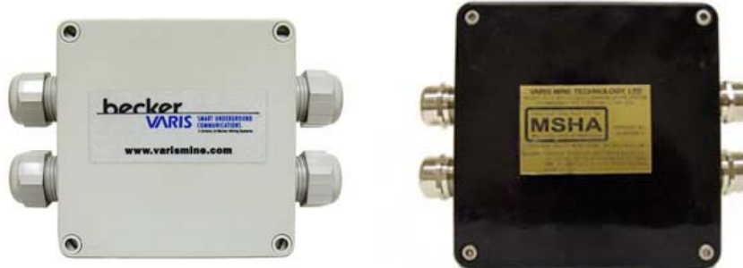
RNG-SP3 (left), RIS-SP3 (right)