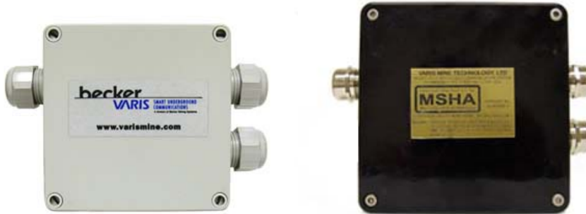
RNG-SP2 (left), RIS-SP2 (right)

TERMINATE: 75 \Omega Termination. NO DC: Blocks DC voltage to/from branch. NORMAL: Passes RF and DC.